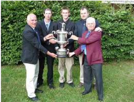
Falkland Islands Rifle Club members and the Junior Kolapore Cup

A Sunday attendance of perhaps 8-10 competitors in the Falklands for a competition is somewhat overshadowed when you are lined up on a shooting mound at Bisley with 300+ people. Fortunately first time attendees are given help, encouragement and guidance by fellow competitors and the sheer volume of participant's means that strict rules, regulations and etiquette have to be observed in this highly competitive and physically and mentally challenging sport. The competitions at the Imperial Meeting are shot over a ten day period which means you could be shooting at 8am and perhaps not finish the day until 8pm, with the weather playing an important role as you are expected to shoot rain or shine.